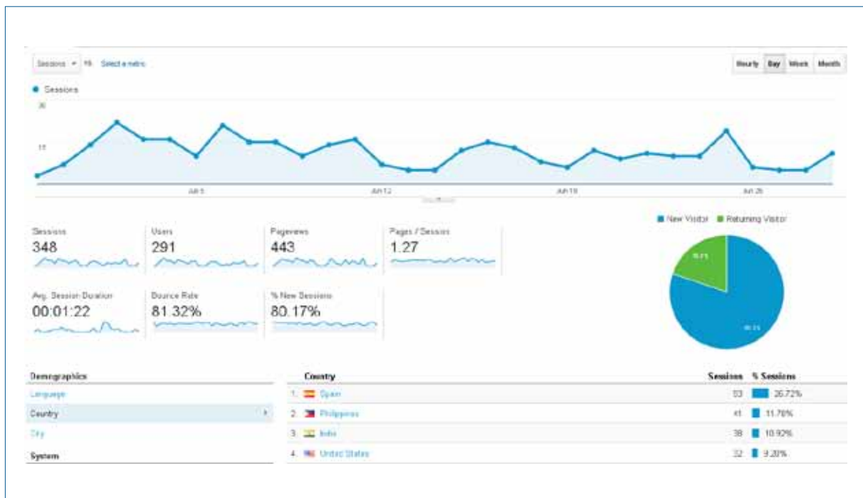
Figure 2. Example of a Google Analytics report

While most LMSs incorporate their own tools to automatically generate customizable statistics reports of course development, these are often quite basic. For instance, Moodle ( https://moodle.org/ ) allows several types of report to be generated: (a) logs for selected activities, students, items and periods of time; (b) live logs, which include recent activity; (c) activity reports, presenting the numbers of views of each activity in a course; (d) course participation, analyzing the actions of selected students for a given period and activity; and (e) data on activity completion. Blackboard ( http://es.blackboard.com/sites/international/globalmaster/ ) also offers several types of report, e.g., (a) user activity overview, which displays overall system and course activity for all students; (b) user statistics, consisting of the average number of students and other users per month and per day; (c) user activity in forums; and (d) user activity in groups. Another interesting tool that can be easily employed is Google Analytics (Figure 2). It can provide information about the number of visits, pages visited, the average duration of each visit, demographics, etc. Regarding monitoring student activity and performance, Lera-López, Faulin, Juan, & Cavaller (2009) review the tools provided by Sakai, WebCT/Blackboard and Moodle.